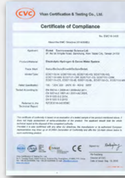
EU CE certified