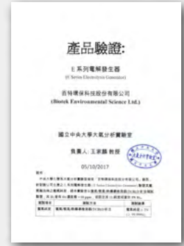
Purity of hydrogen gas exceeds 99.999%