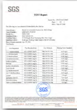
Quality of drinking water tested by SGS