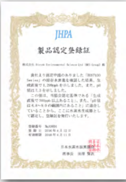
Concentration of hydrogen water at 1,299ppb